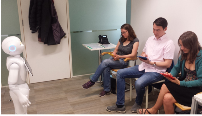
Fig. 1. Experimental Setting. The observers sit at a distance of roughly 1.5 meters from the robot and provide their ratings using a tablet.

case, corresponds to a uniform distribution of points across the different variants. The \chi^2 variable above allows one to test whether the observed distribution of the points deviates from the uniform distribution to a statistically significant extent. When this is the case, it is possible to say that the Godspeed tendency associated to column j in S is more or less pronounced depending on the particular gesture being displayed.